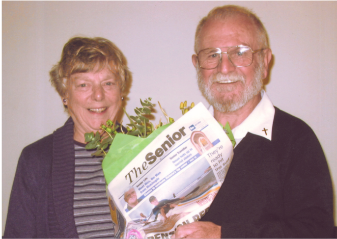
The Day Del became a senior! A rare bunch of flowers!