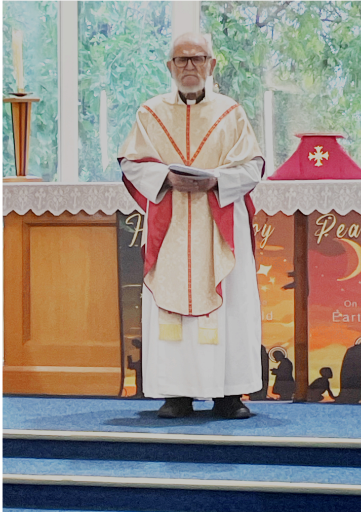
60 th Anniversary of Priesting 21 December, 2026